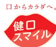
Yamaguchi Prefecture's Healthy Smile logo

As a healthcare company with businesses spanning household products, foods with function claims, OCT drugs and other products, in addition to providing products, Lion is engaged in a variety of initiatives aimed at enhancing consumers' quality of life and lengthening their healthy life expectancy. Lion entered into the collaboration agreement with Yamaguchi Prefecture because it believes that participation in the Healthy Smile Program will help to achieve its objective of providing "opportunities for everyone to practice oral healthcare whenever necessary."