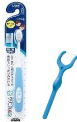
Reference: Pamphlet, children's toothbrush and dental floss distributed for the 77th annual event

*This dental floss is designed for use by both children and adults